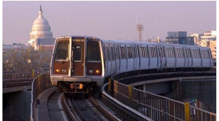
Washington Metro Washington D.C.