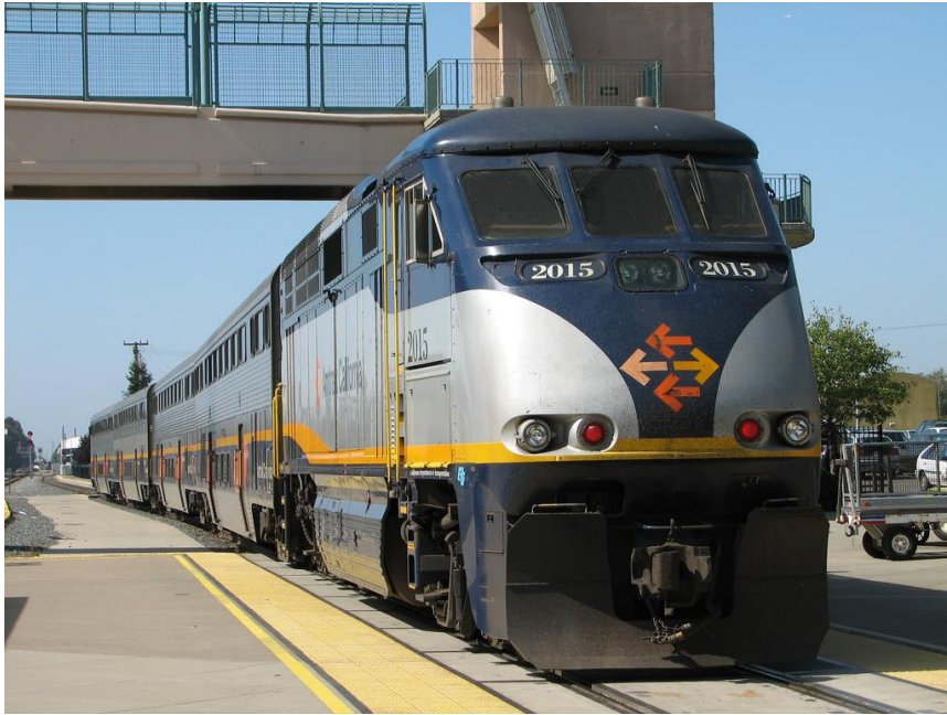
Capitol Corridor Train Auburn, CA -> San José, CA