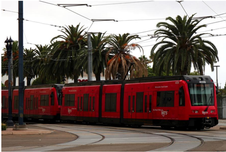
San Diego Trolley (SDTI) San Diego, CA