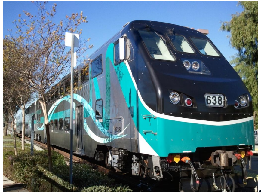
Metrolink Southern California