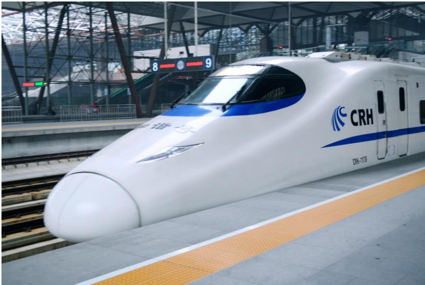
China Railway High-Speed (CRH) China