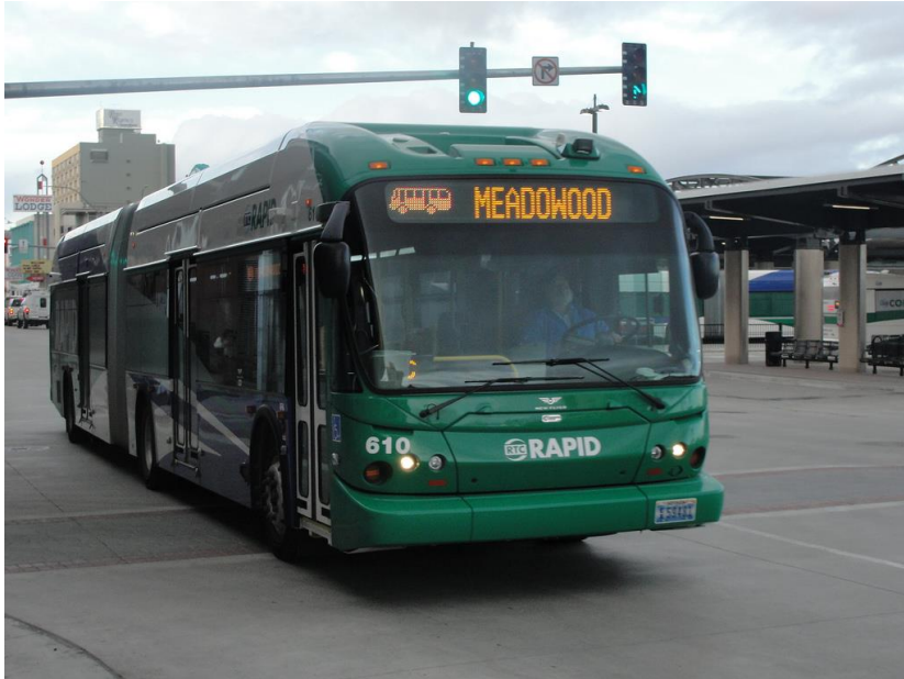
RTC Rapid Reno, NV