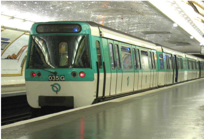
Paris Métro France