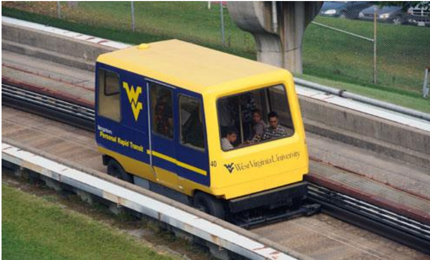
Morgantown Personal Rapid Transit (WVU PRT) Morgantown, WV