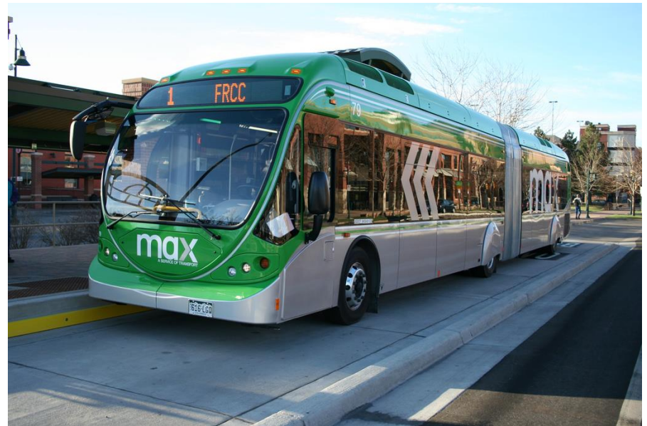
MAX BRT Fort Collins, CO