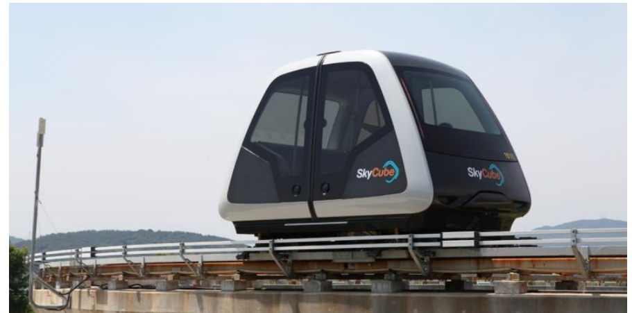
Skycube Suncheon, South Korea