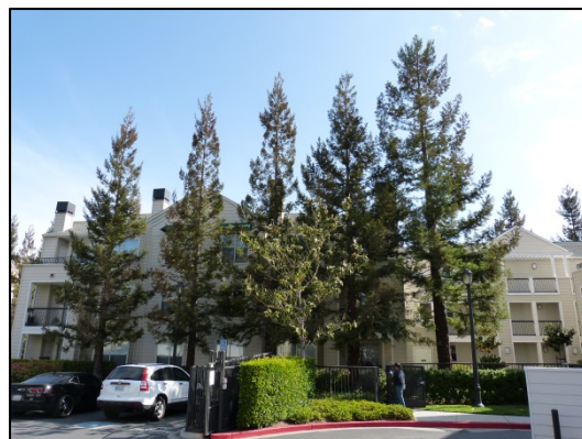
Photo 1. Typical row of coast redwood trees. Note good form and thin canopies.

Redwoods #73 – 79 and 393 had been relocated to their current location. Trees were in the same overall condition as those that had not been transplanted.