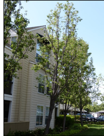
Photo 2. Typical Callery pear: planted next to a building with a narrow crown and very thin canopy of foliage.

Thirty-nine (39) purpleleaf plums were concentrated in two areas of the community (Photo 3). Trees were mature in development with trunk diameters between 6" and 12". Trees had been pruned to lift and open the canopies. Tree condition was a mix of good (27 trees) and fair (12).