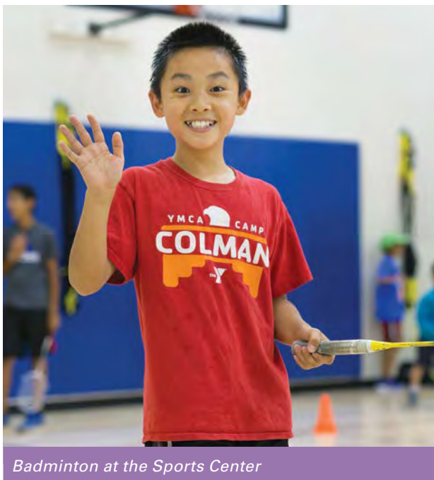
Badminton at the Sports Center