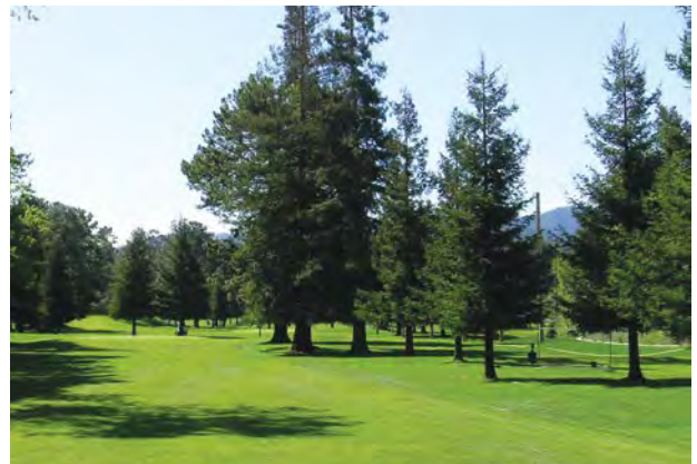
Blackberry Farm Golf Course