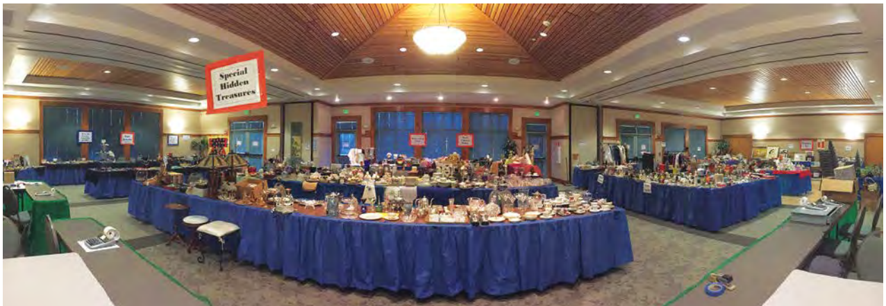
One of the fundraising activities held at the Senior Center

The commission works in partnership with the Cupertino Library Foundation, the Friends of the Library and the City to support the Poet Laureate program. ■