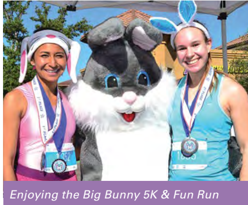
Enjoying the Big Bunny 5K & Fun Run

The Cupertino Recreation and Community Services Department Divisions consist of Administration; Sports, Safety, and Outdoor Recreation; Recreation and Education; and Business and Community Services. In addition, we are the liaison to the Santa Clara County Library System and to our three school districts.