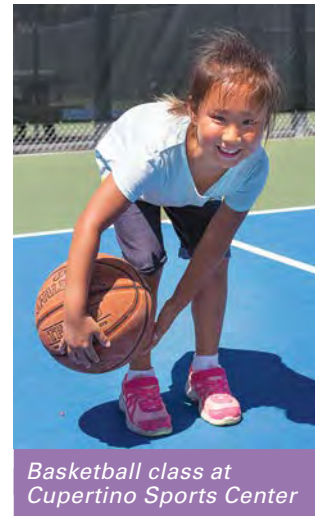
Basketball class at Cupertino Sports Center