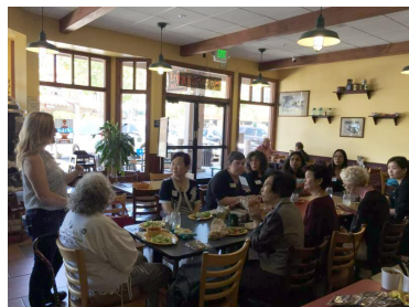
June Networking Lunch Mixer