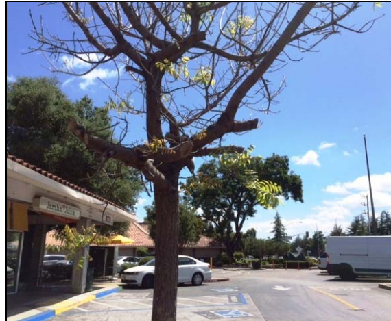
Photo 1: Looking east at Chinese pistache #76. The tree was young, at 5" in diameter and in poor condition. It had been topped and the branches reduced to stubs. This was the typical treatment of all Chinese pistache at the site.

Twenty-four (24) Chinese pistache and 24 evergreen ash were assessed at the site and represented the two most frequently occurring species. Chinese pistache were located in the parking lot islands on the east (#11-14), north (#45-57) and south (#70-76) sides of the buildings. The trees were all young, with diameters between 5" and 11". Condition was poor (18 trees) to fair (6 trees) as a result of the topping that compromised the structure of the trees ( Photo 1 ).