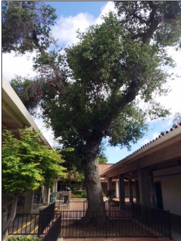
Photo 2: Looking east at coast live oak #19. The tree was mature, at 29" in diameter. It was in poor condition, with extensive dieback in the crown. Non-industry standard cables had been installed.

The remaining 10 species were represented by 3 or fewer individuals and included: