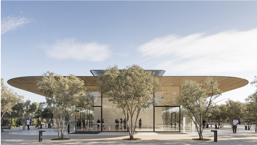
Apple Park Visitor Center

In the late 20th century, Cupertino and the surrounding areas experienced another surge in population growth, this time due to the immigration of people from Asian countries. Immigration laws at the time were in favor of families looking to move to Silicon Valley. People immigrated here for a variety of reasons—whether they were aspiring for career prospects with major tech companies, or striving for quality education for their children, everyone who immigrated here had a common goal: to find opportunities to work hard for a better life for themselves and their families.