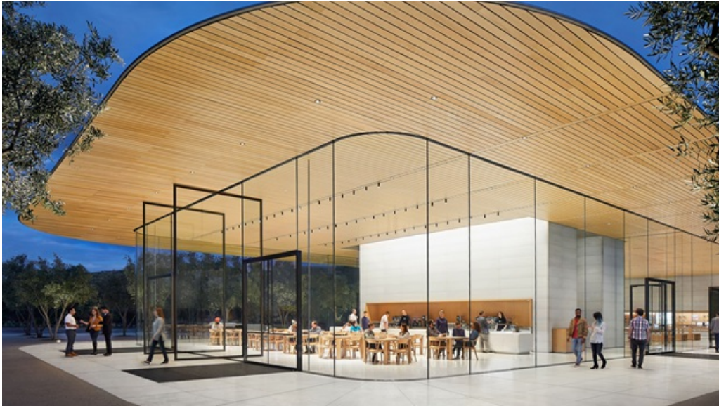
Apple Park Retail Store

Apple Park, Apple's newest corporate campus, features approximately 2.8 million square feet of office and R&D space north of Highway 280 between Wolfe Road and Tantau Avenue. A state-of-the-art Visitors Center, Observation Deck, flagship retail store, and café offer the public a place to learn, explore, and shop.