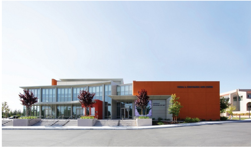
Euphrat Museum of Art

The highly regarded Euphrat Museum of Art, at its new location next to the new Visual Arts and Performance Center at De Anza College, presents one-of-a-kind exhibitions, publications, and events reflecting the rich diverse heritage of our area. The Museum prides itself on its changing exhibitions of national and international stature emphasizing Bay Area artists. Museum hours are 11 a.m. – 3 p.m. Tuesday through Thursday. Telephone: 408-864-5464