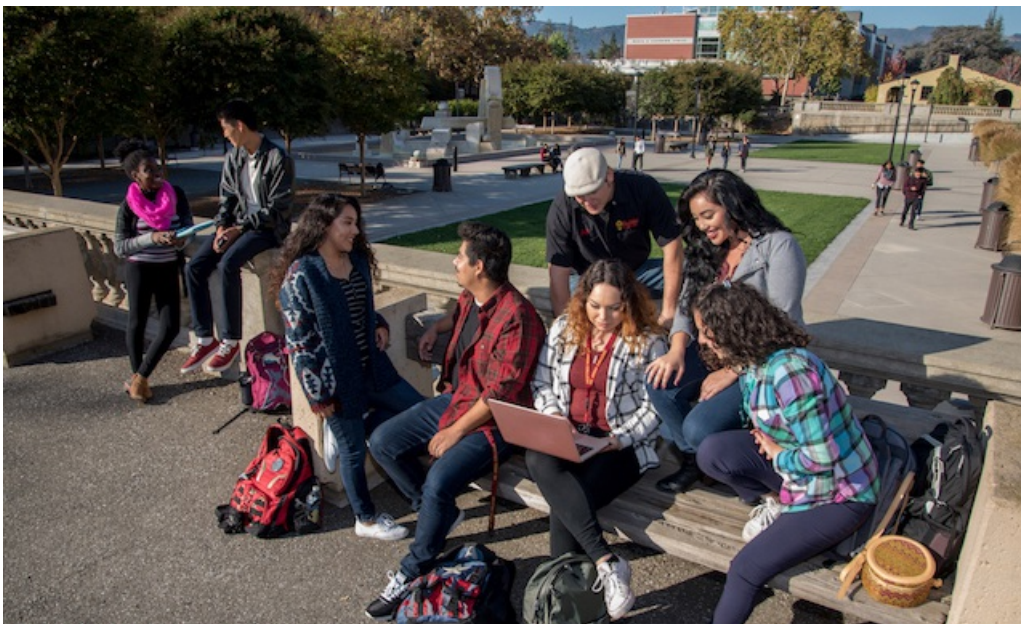
De Anza College Campus

Building on its tradition of excellence and innovation, De Anza College challenges students of every background to develop their intellect, character, and abilities; to achieve their educational goals; and to serve their community in a diverse and changing world.