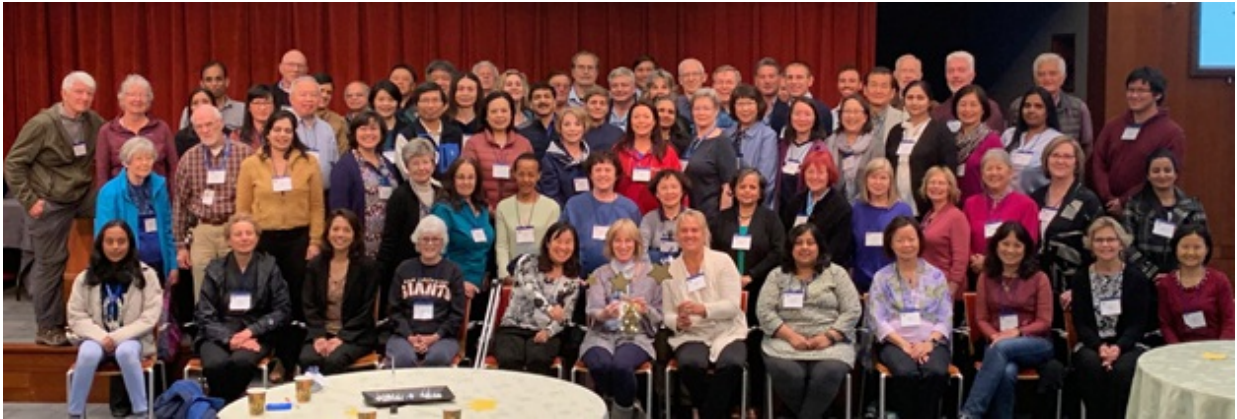
Neighborhood Block Leader Program

Block Leaders are engaged Cupertino residents who go the extra mile to build a more connected and resilient community. The program shares City news, hazards, and events with Block Leaders, provides support for community building, and organizes quarterly meetings. Quarterly meetings invite City staff from across departments so that volunteers and residents are kept up to date on new policies, programs, and projects. Volunteers facilitate information sharing between the City and residents, host community gatherings such as emergency kit building workshops, and build a sense of trust and safety in their neighborhoods. To become a Cupertino Block Leader, please contact the Block Leader Coordinator at martad@cupertino.org .