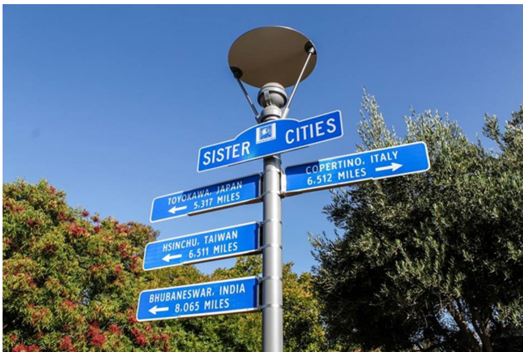
Cupertino Sister Cities Sign

The City of Cupertino recognizes the value of developing people-to-people contacts by strengthening the partnerships between the city and its four sister cities of Copertino, Italy; Hsinchu, Taiwan; Toyokawa, Japan, and Bhubaneswar, India. Cupertino’s Sister City partnerships have proven successful in fostering educational, technical, economic, and cultural exchanges. Over the years, there have been many delegations visiting both the cities as well as many local students participating in annual student exchange programs.